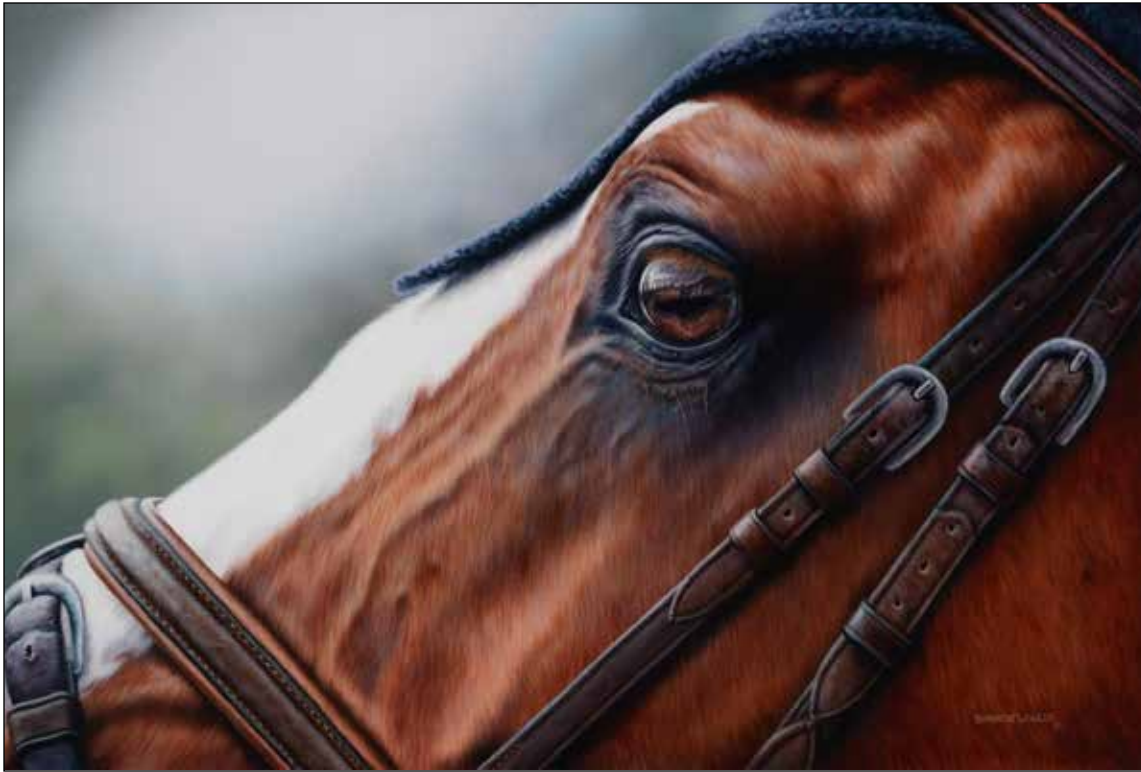
SL FLEXIBLE SOUL original acrylic painting 24" x 36"