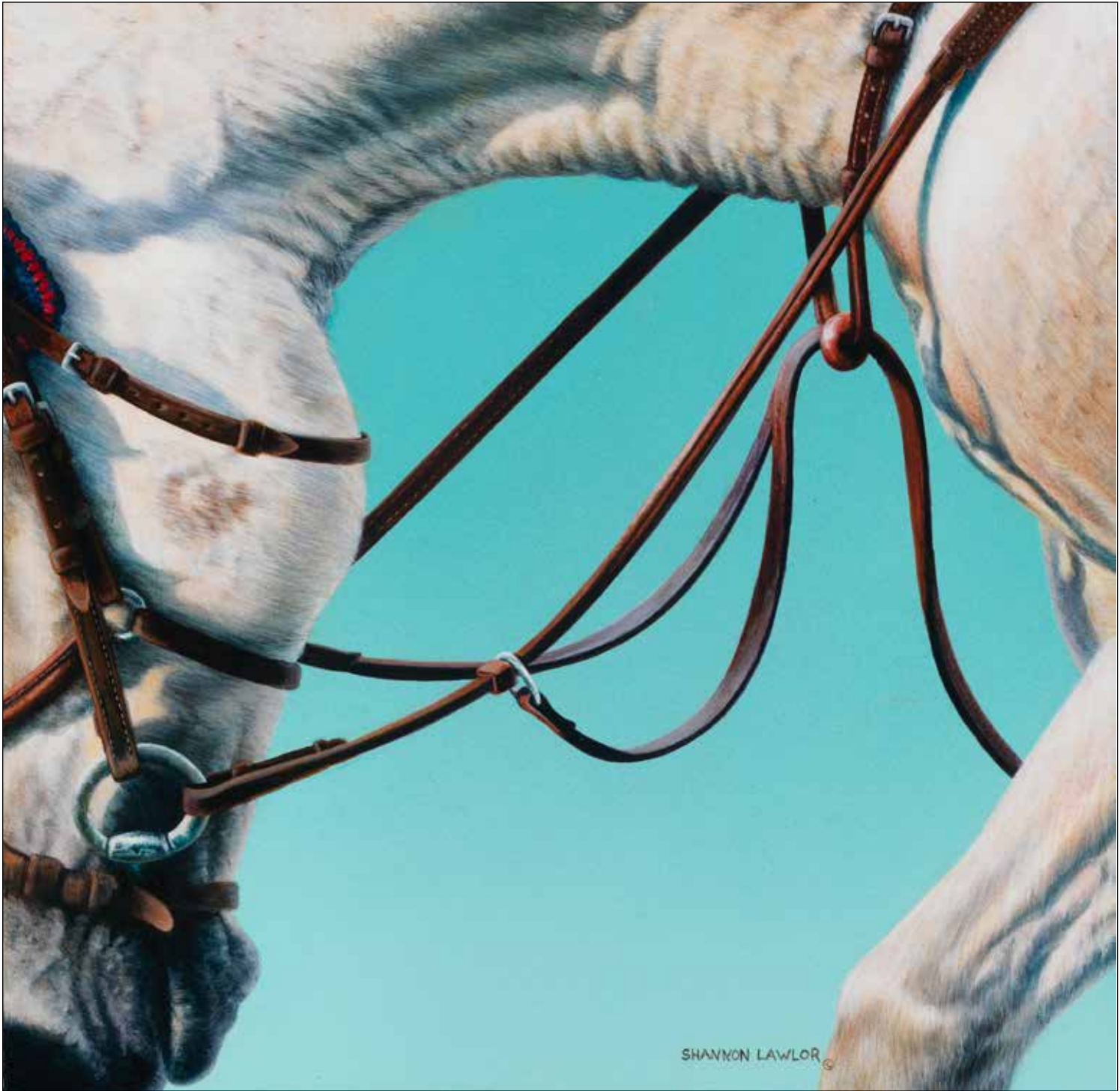
SL NAUTICAL original acrylic painting 13" x 13"