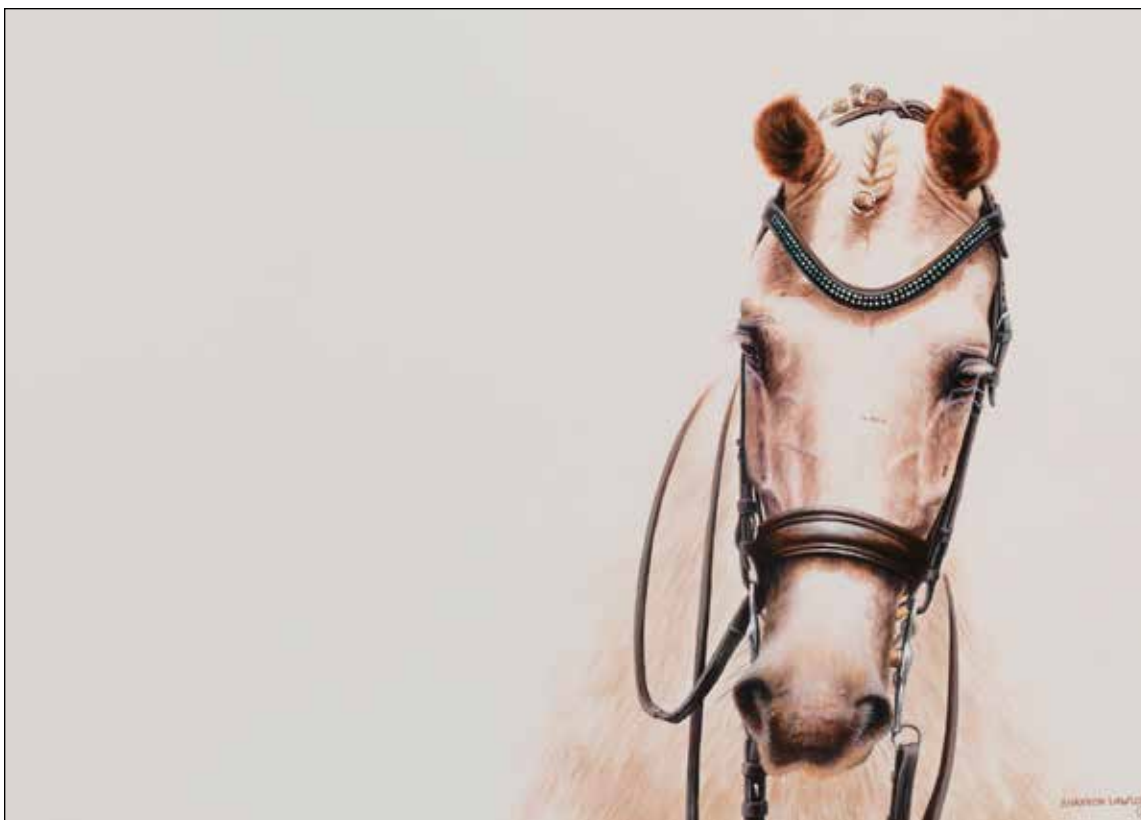
SL FLAMBO original acrylic painting 17" x 23"